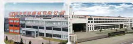
Foshan Shunde - Two Facilities 150000m 2