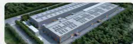
Shanwei Luhe Facility 62360m 2