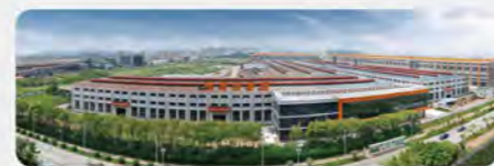
Shenzhen Industrial Park Facility 560000m 2