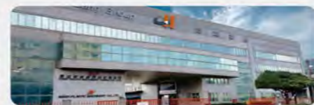
Taiwan Taoyuan Facility 30000m 2