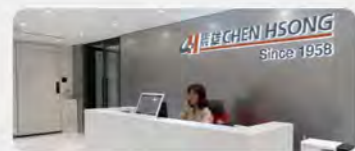
Hong Kong Headquarters