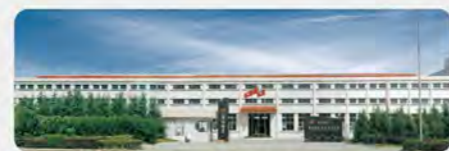
Zhejiang Ningbo Facility 70000m 2