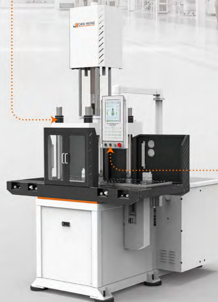
Right Injection Unit

Multi-station models come standard with independent injection parameter adjustment, adapting to varying mold wear conditions. This boosts production yield and ensures long-term operational stability.